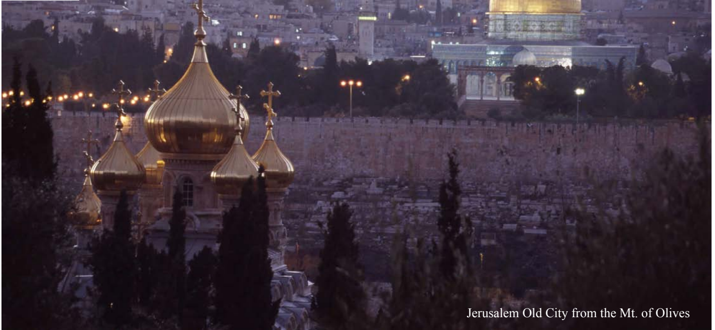
Jerusalem Old City from the Mt. of Olives